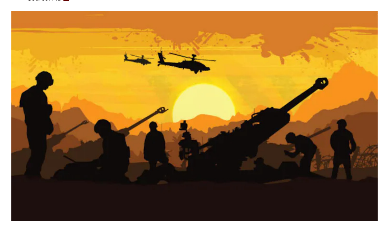
- Meghna Chukkath